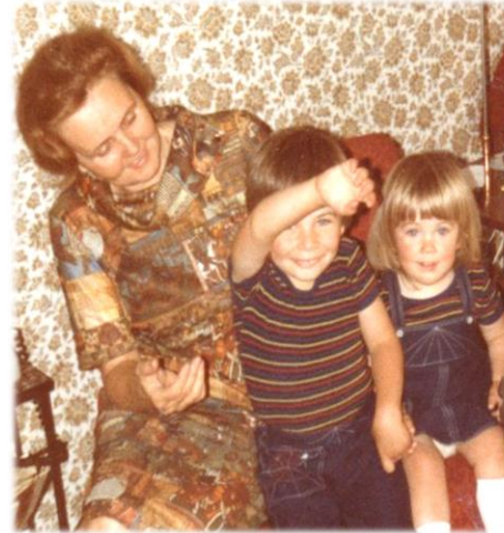
Always organising something for her grandchildren – Zawsze organizowała coś dla wnucząt