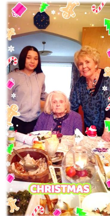
Last Christmas 2021 with her great granddaughter –